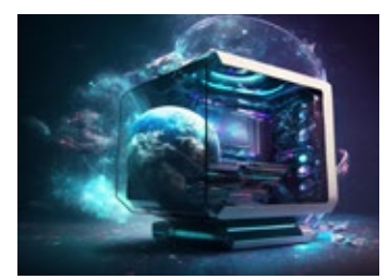
Technology and information security sector